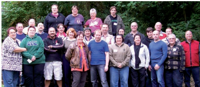
Participants at CTU Out@Work Kamp 2007

Lesbian, Gay, Bisexual, Transgender, Intersex, Takataapui, Fa'afafine, and Queer workers (LGBTI) often experience workplace discrimination. Trade unions have an important role to play in protecting and defending their rights.